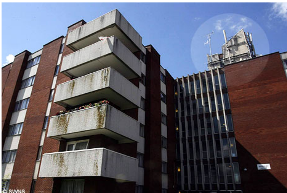
Anger: The mast (circled) on the block known to locals as the Tower of Doom