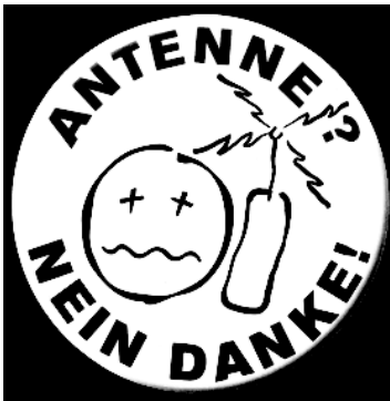
“Low Radiation Is Better,” says Hagenuk.